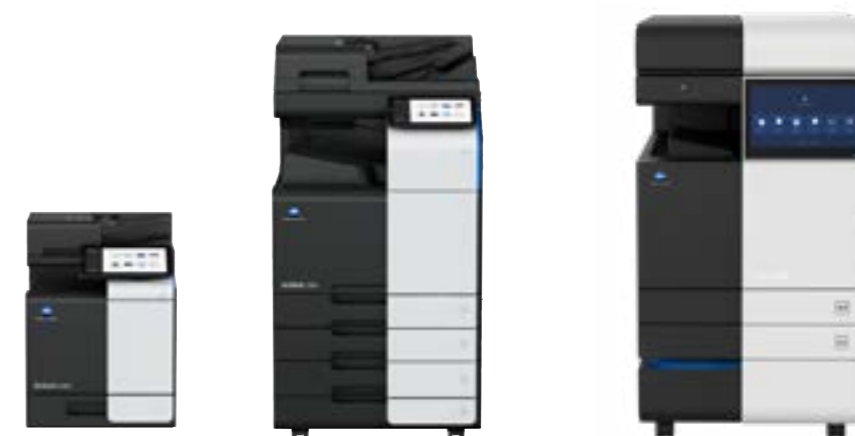
bizhub i-Series C4050i

So as your business grows, we will grow with you – seamlessly linking people and places to give a new dimension to document workflow and security management.